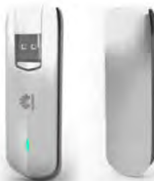
Figure 1-1 E3276s-150 profile